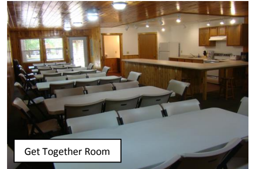
Get Together Room